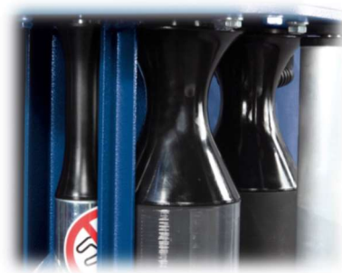
LAYOUT MASTERWRAP HD [inch]

The PGS film carriage is fixed gear 250% power pre-stretch and the force to load (tension) is controlled by a strain gauge, adjusted on the control panel.